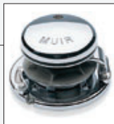
Round base Muir 2500